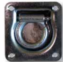
102mm (l) x 95mm (w)