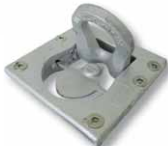
108mm (l) x 106mm (w)