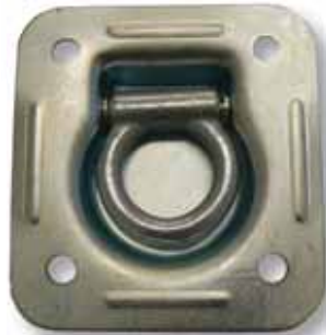
124mm (l) x 115mm (w)