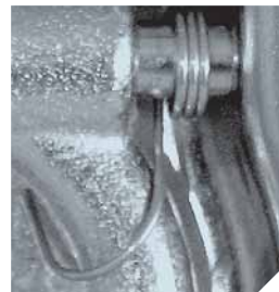
Anti rattle spring