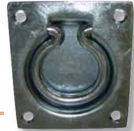
89mm (l) x 76mm (w)

1.3mm thick with pressed steel ring. SWL 100kg.