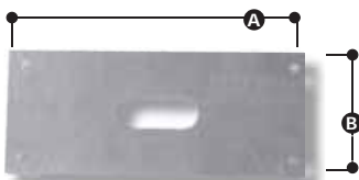
TE12F864 - 16mm