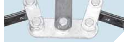
All bolts lock-tabbed