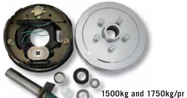
1500kg and 1750kg/pr

CM offer a range of 10" and 12" electric brakes for trailers up to 3500kg. To see how electric brakes work, go to the section on page 49.