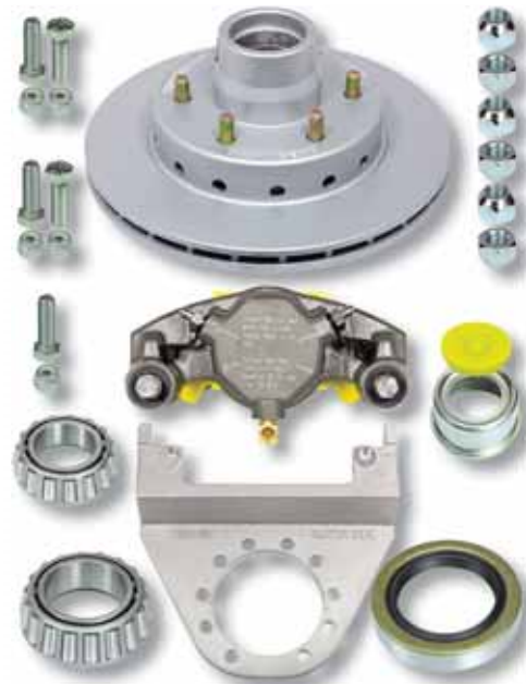
TE2HRCM12SCAD half set pictured