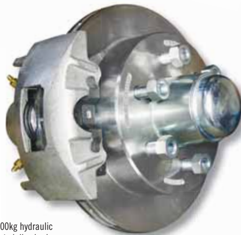
3500kg hydraulic vented disc brake