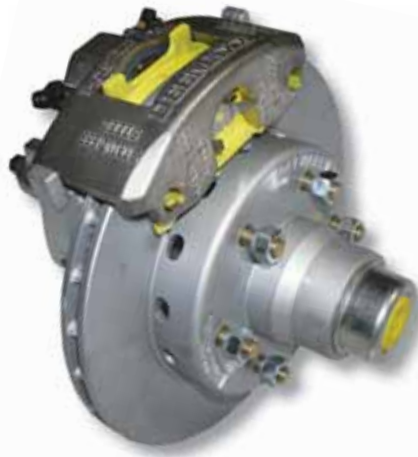
2750kg hydraulic vented disc brake