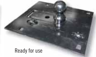
Ready for use