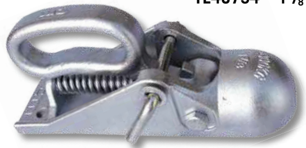
TE4C794 – 1 7/8"

* Note: the 50mm coupling is not CM brand.